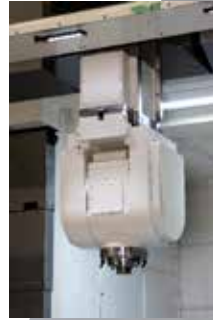
4 axis Head