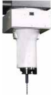
Long Shout Head